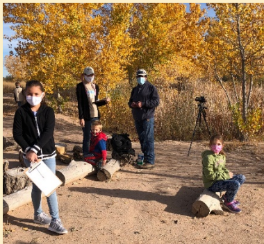
Autumnal Studies @ WWCA

Board of Supervisors Special Meeting October 30th, 2019 10:00 a.m. Whitfield Wildlife Conservation Area 2424 Hwy 47 Belen, NM 87002